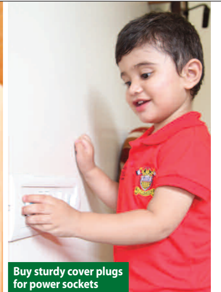
Buy sturdy cover plugs for power sockets